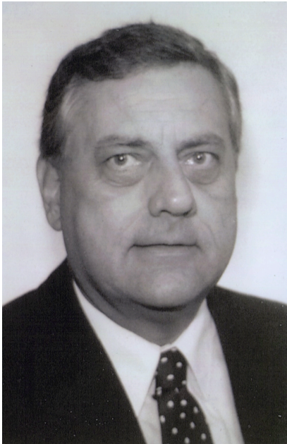
RBYC COMMODORE: 1997 - 1998